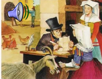
Bata yikya irubasa koe wida poke Napoli koe Italia va sanegaf sutesik dodor. Inye va tva ke aguntanikiq beilir aze va dulzeks fu sutelar. Arbe bema, jontik italiik me grubeled.