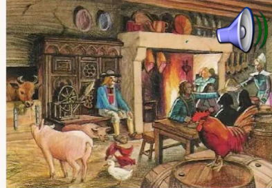
Koe breizaf vesk, blira gitr sutafa : sinka tir kum ebeltaf beg bumeyen koe kwafe cade, is umtakirafe abra. Ulida tir valdaja. Tawadayik va intockem tiskir. Bonoleem koe dofa bonta senyer. Toloy rumeik fuxe sana abdi tolda mialukon mulufled.